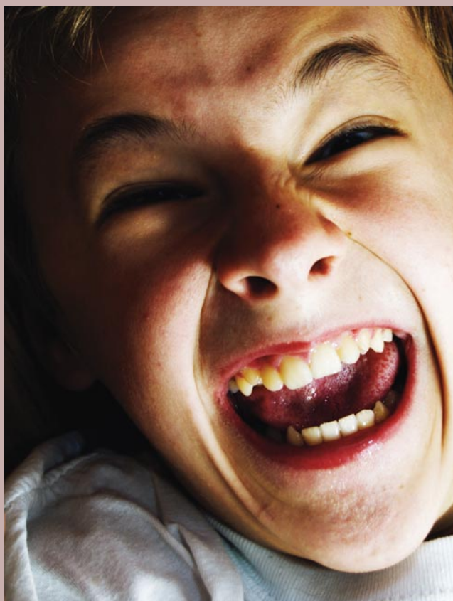
(POSED BY MODEL – FOR ILLUSTRATION PURPOSES ONLY)

Coaching children with ADHD is not easy. The results have to be measurable and the solutions have to be practised outside of the sessions